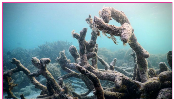
Figure 2. Dead coral skeletons after bleaching on the Great Barrier Reef.