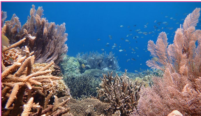
Figure 1. A healthy coral reef in Sulawesi, Indonesia.

Because corals are attached to rocks and don't move, what do some people mistake corals for?