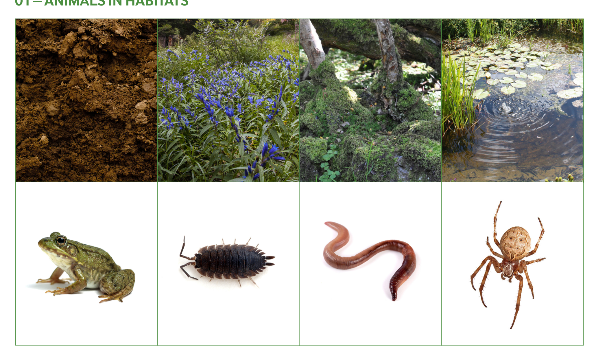
YEAR 4 LIVING THINGS AND THEIR HABITATS: 01 – ANIMALS IN HABITATS