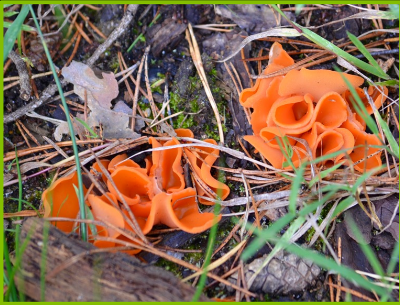
orange peel fungus