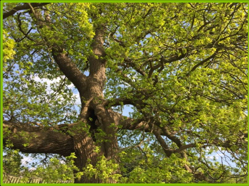
oak tree in spring