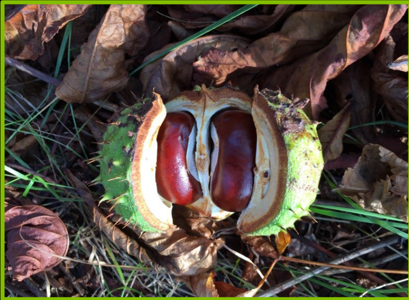
horse chestnut (conkers)