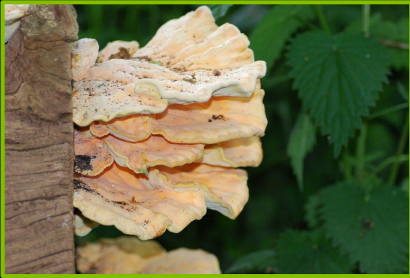
chicken of the woods fungus