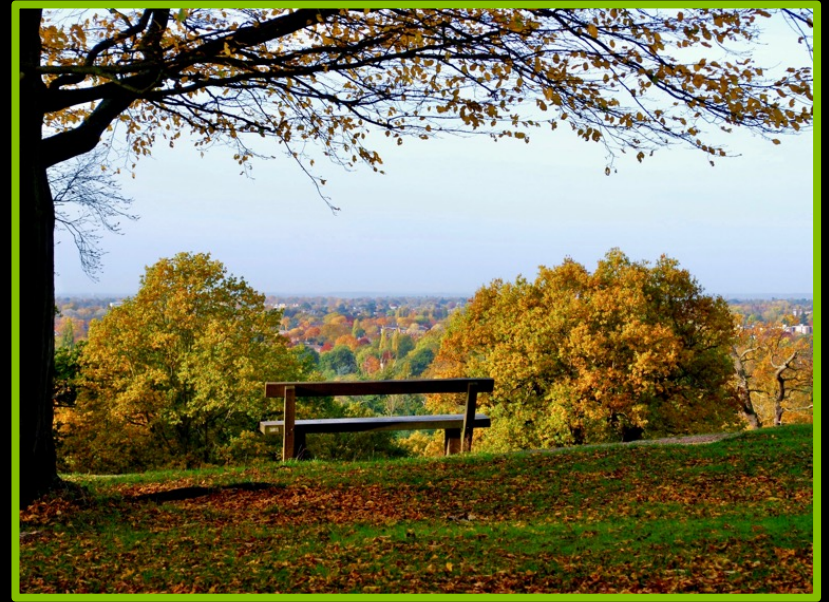
oak trees in autumn