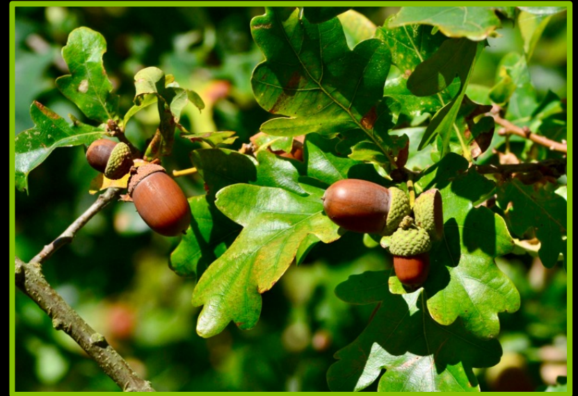
acorns on the English oak tree