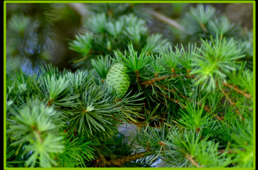
pine needles and cone