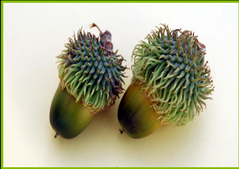
acorns from a Turkey oak tree