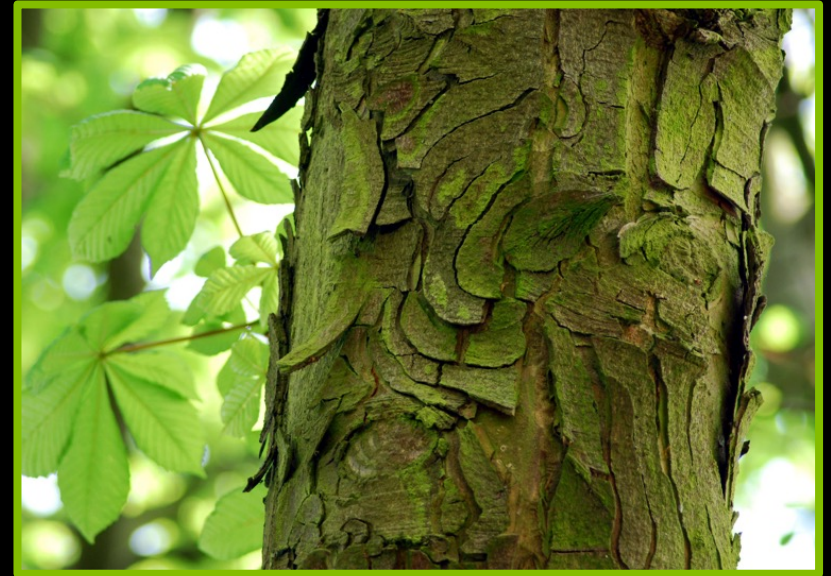
horse chestnut trunk and leaves