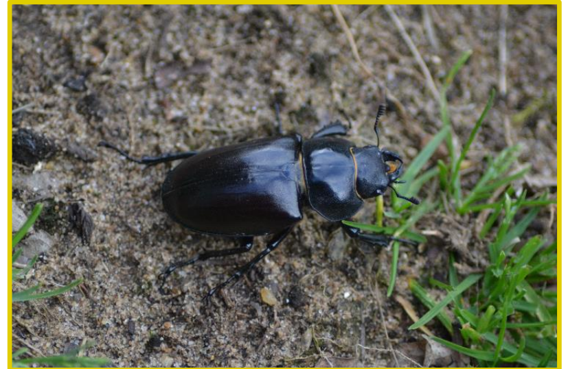
stag beetle, female