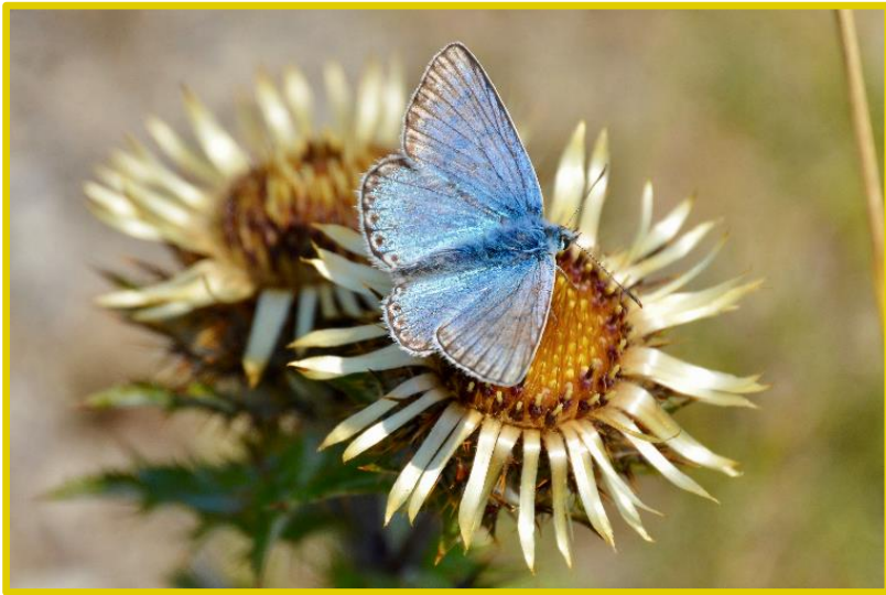
chalkhill blue butterfly