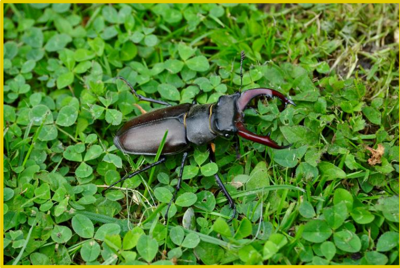
stag beetle, male