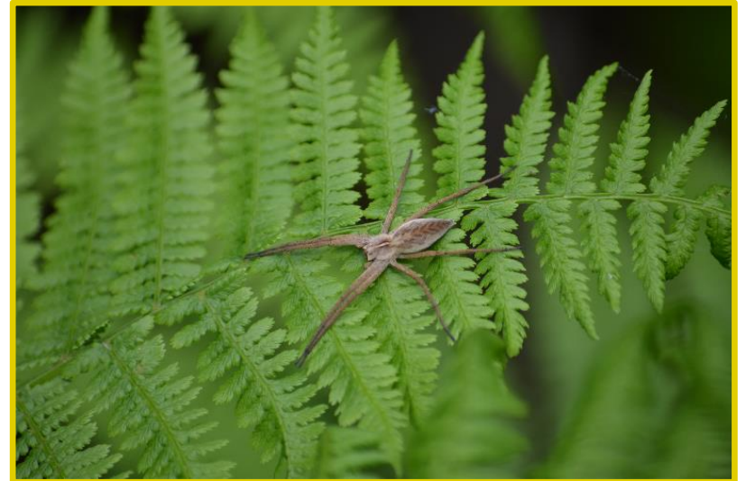
nursery web spider