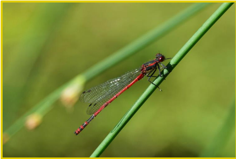
large red damselfly