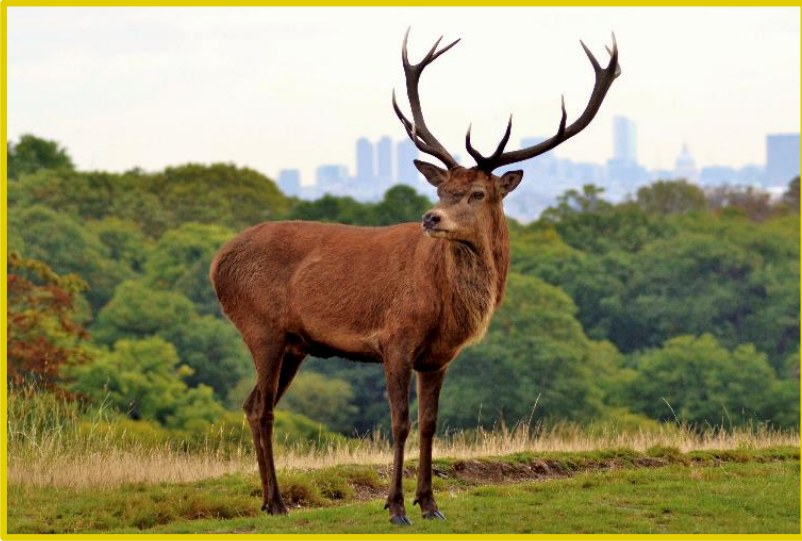
red deer, male