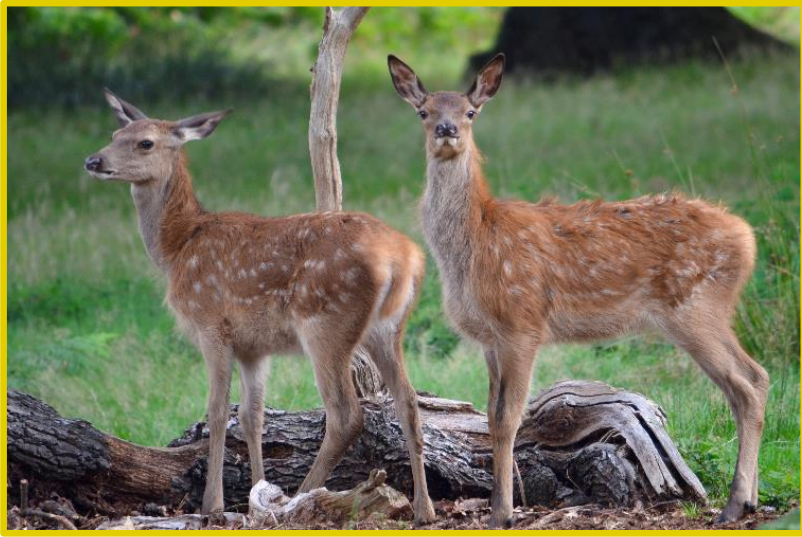
red deer, calves