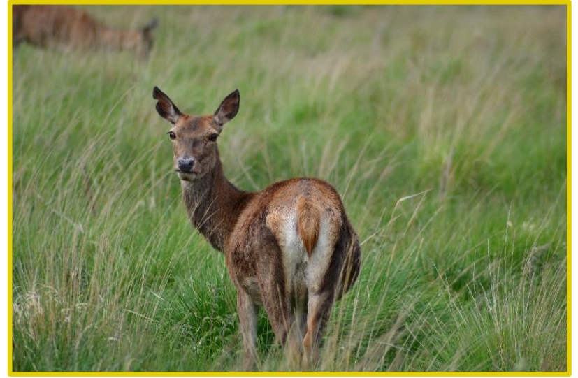
red deer, female